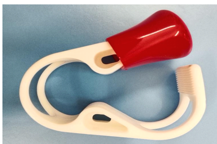
Pinch Clamp with red cap